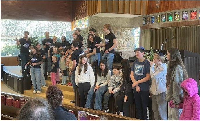
Kesher students sing with STAAM - Washington University's Jewish A Capella Group