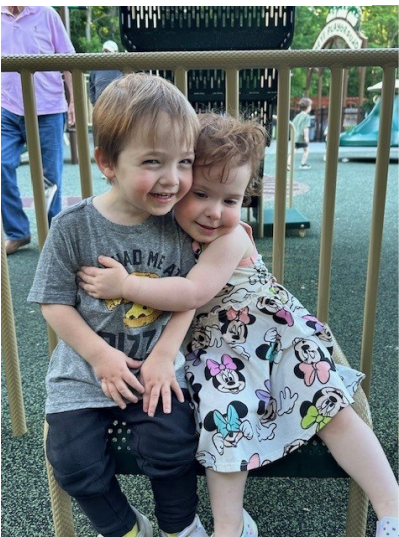
TeeBeEs Playground Shabbat