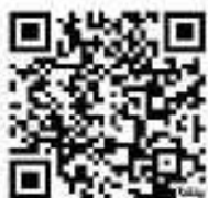
Slate of Nominees

All TBE members in good standing are encouraged to attend the meeting and vote. However, if you cannot attend, you may vote by proxy. To learn more, go to tbe.org/2026-proxy-voting .